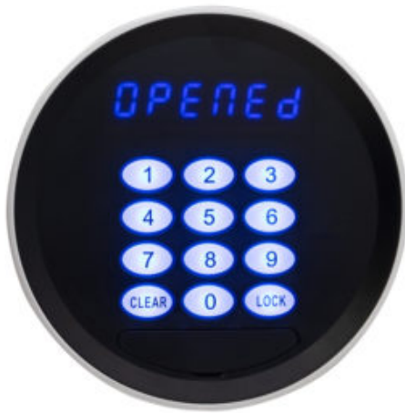
Ammunition cabinet keypad