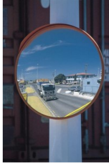
450mm Stainless Steel Anti-Vandal Mirror