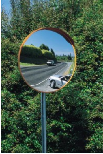
450mm Stainless Steel Anti-Vandal Mirror