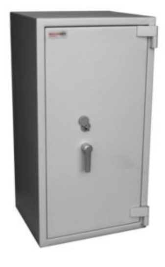
Euro Grade 2215