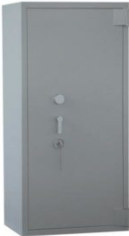
Euro Grade 5535