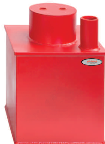
12" CUBE WITH DEPOSIT

THE PHOENIX CHARON (ROUND DOOR) UF0900 SERIES underfloor security safes has been designed to meet the requirements for a secure yet hidden safe, and comes with 4 different cash cover options.